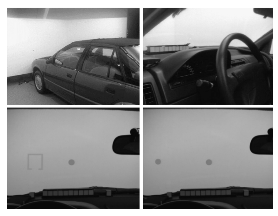
Fig. 1. Participants sat in the driver's seat of the SIREN simulator (top left) and viewed targets (bottom left) and either extra-vehicular cues presented on the center screen (bottom right) or in-vehicular cues. The top right image shows the implementation of the LEDs for the in-vehicle visual cues and the flat speakers for the auditory cues placed inside the vehicle cab.