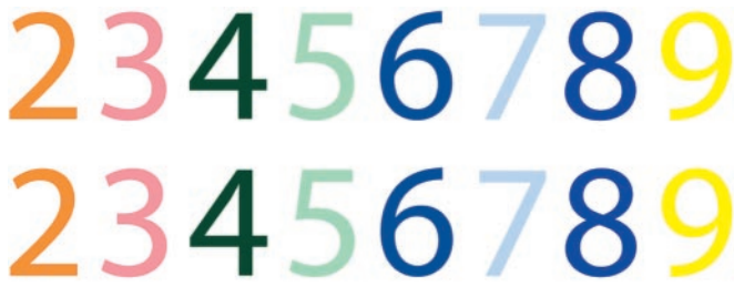
Fig. 1. Synesthetic colors associated with the digits 2–9 by WO on two separate occasions.

forms, he reported that the synesthetic color suddenly switched to that of the local forms (e.g., orange for the 2s).