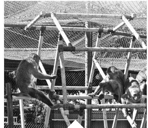
NONHUMAN PRIMATES USED IN MEDICAL RESEARCH

Monkeys are often involved at the later stage of the process—what is called translational or applied research. Here all of the knowledge accumulated earlier is applied to specific medical questions such as: Will this vaccine protect a pregnant woman (and her baby) from Zika infection? And is the vaccine likely to be safe?